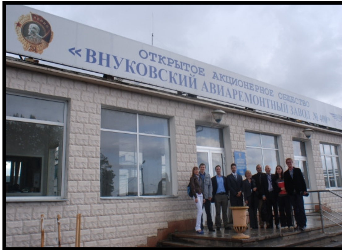
The Ontario delegation during MAKS Was presented VARZ-400.