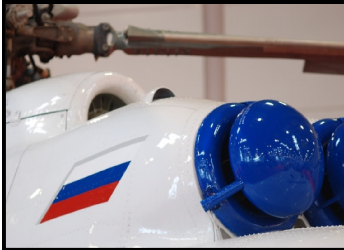
The air intake of a Mi-26 at HeliRussia