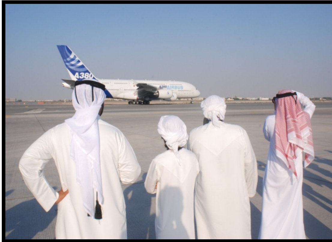
The A380 one of the Dubai Air Show stars.