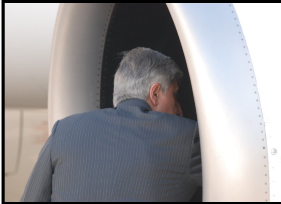
Mikhail Pogosian inspecting the SuperJet's SaM-146 at the Paris Air Show.