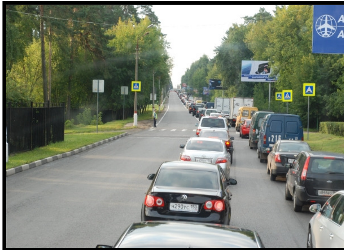
The usual first day at MAKS