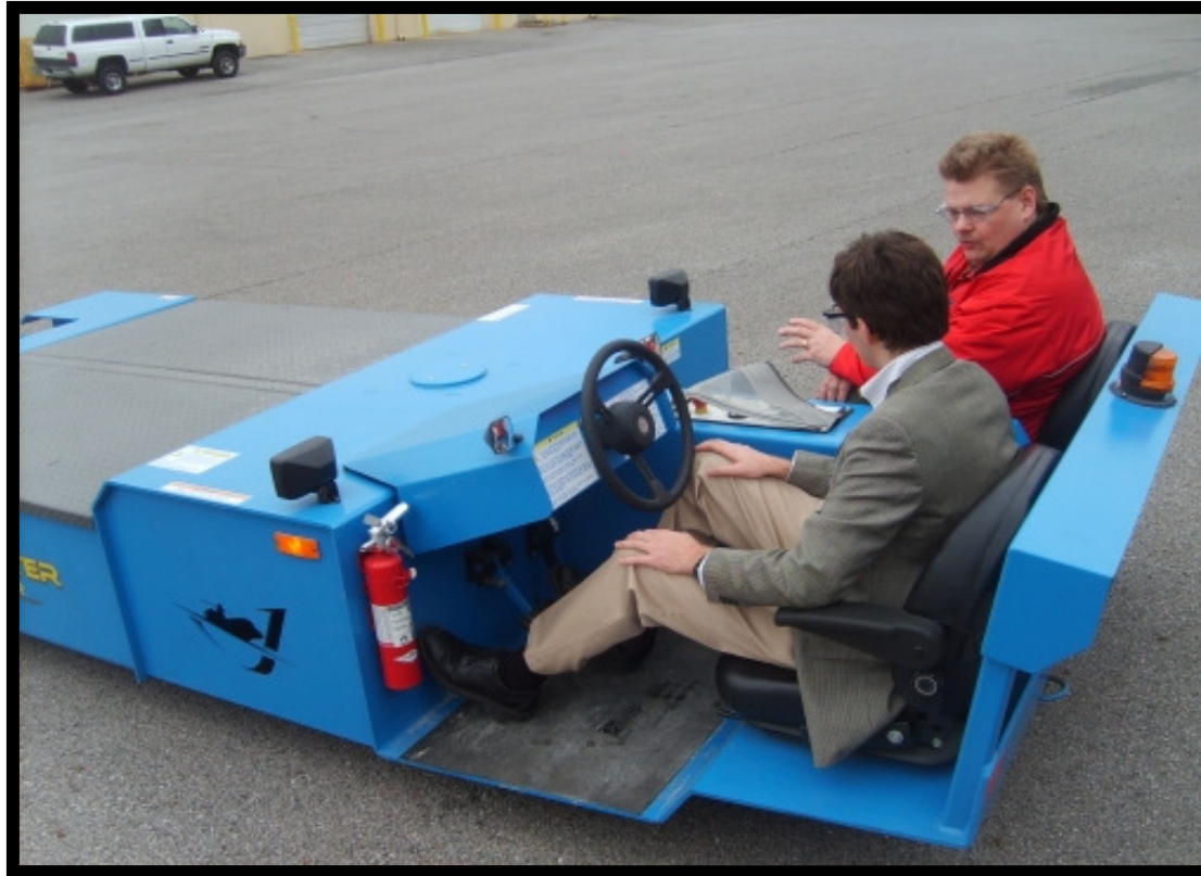
A JetPorter test drive at the Tronair factory in Ohio.